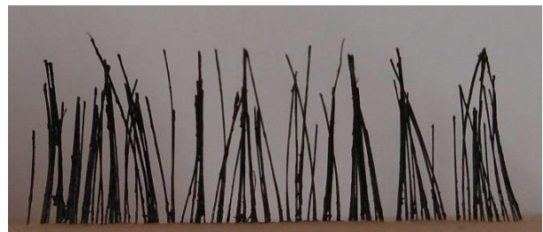
3% ECOFIBER 10D-2T