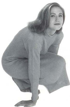
Pure Ramie, Pure Linen, and Blended Products (Fashion Goods)