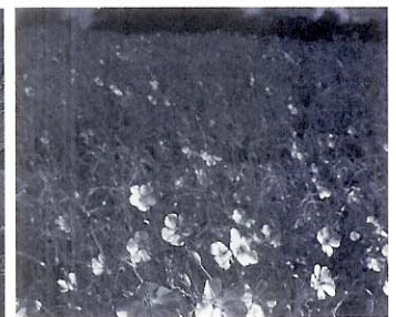
Flax Field (Raw material of Linen)