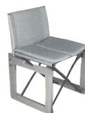
Flameproof products Canvas products