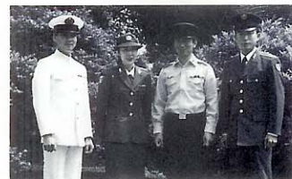
Ramie Blended Uniform