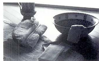
Pure Ramie, Pure Linen, and Blended Products (Interior Goods)