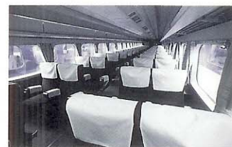
Ramie Head Rest Cover of the Super express Train (Shinkansen)